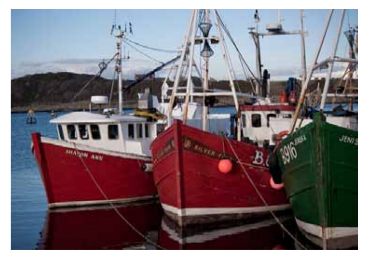
Fishing boats in Ardglass harbour